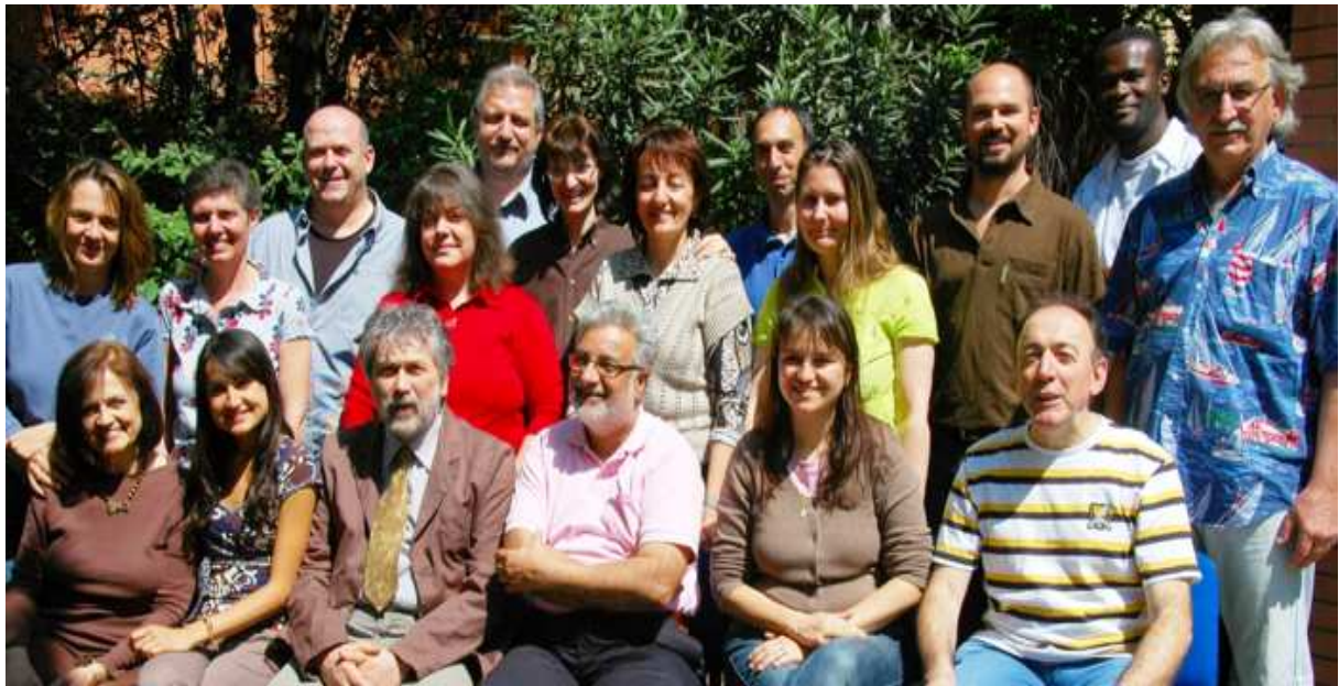
Staff at AIFO Head-office in Bologna

Italian Association Amici di Raoul Follereau (AIFO) is an Italian Non-Governmental Organisation (NGO), registered with Italian Health Ministry. It is recognized by Italian Foreign Ministry and European Commission, and has a Framework Partnership Agreement with ECHO. AIFO is in official relationship with World Health Organisation. The head-office of AIFO is in Via Borselli 4-6, 40135 Bologna, Italy, tel. +39-051-4393.211. Email: info@aifo.it and Website: http://www.aifo.it/english/ (A longer version of this report is available on this website).